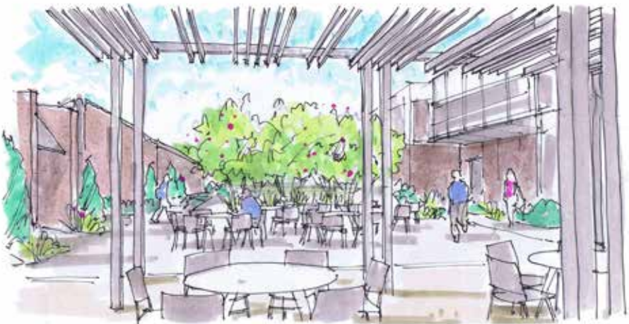
High school outdoor dining area and courtyard

It is now our responsibility - our great privilege - to take up the challenge of keeping St. John School a vital educational and spiritual beacon for generations to come.