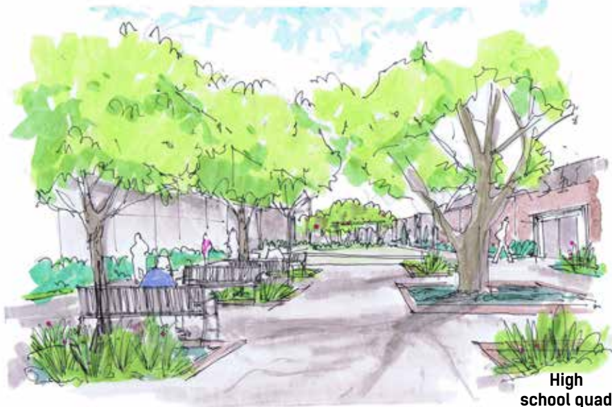
High school quad