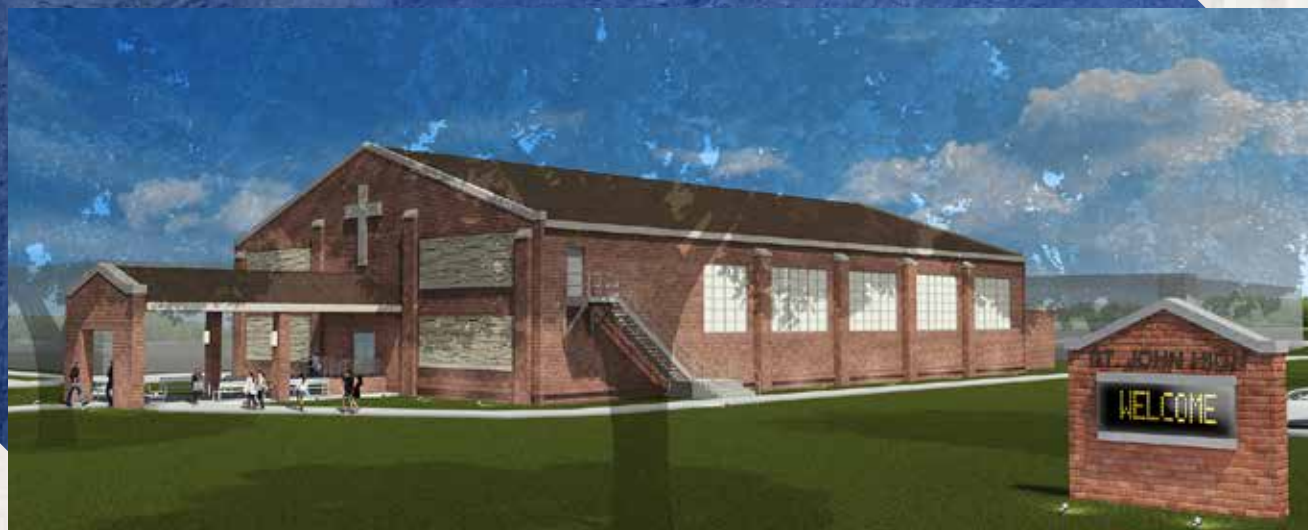
Future gymnasium exterior