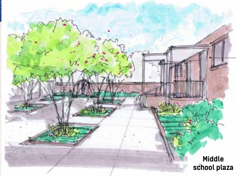
Middle school plaza

It is now our responsibility - our great privilege - to take up the challenge of keeping St. John School a vital educational and spiritual beacon for generations to come.