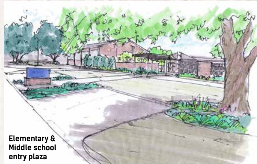
Elementary & Middle school entry plaza